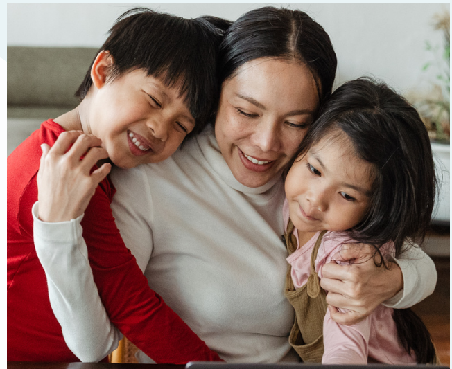
*Names and photos changed to protect client privacy and safety.